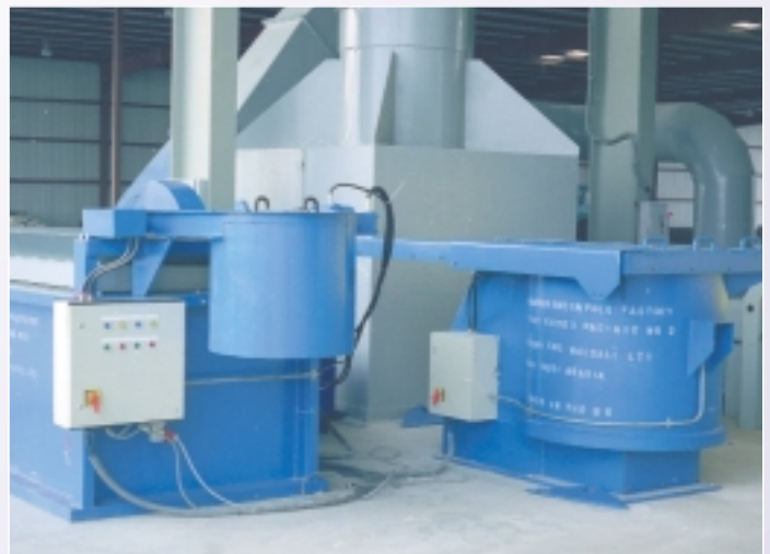
Centrifuge Machine with semi-automatic basket discharge with integral quench unit